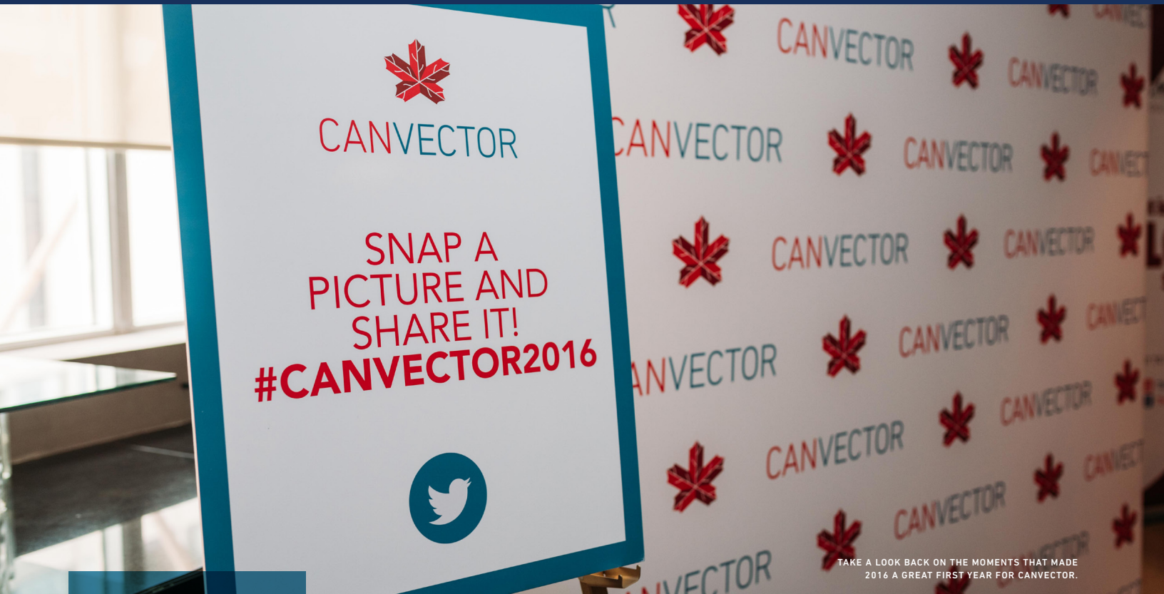
TAKE A LOOK BACK ON THE MOMENTS THAT MADE 2016 A GREAT FIRST YEAR FOR CANVECTOR.

IN THIS NEWSLETTER: MESSAGE FROM THE DIRECTORS A YEAR OF FIRSTS COMING UP IN 2017 IN THE LOOP: ANNOUNCEMENTS